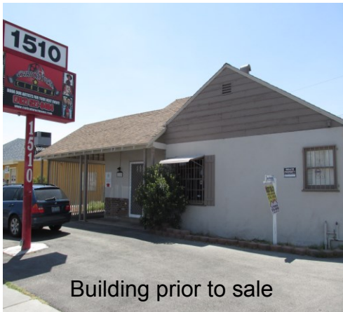
Building prior to sale

GES was contracted by Meadows Bank to perform these tests prior to the approval of the final sale transaction.