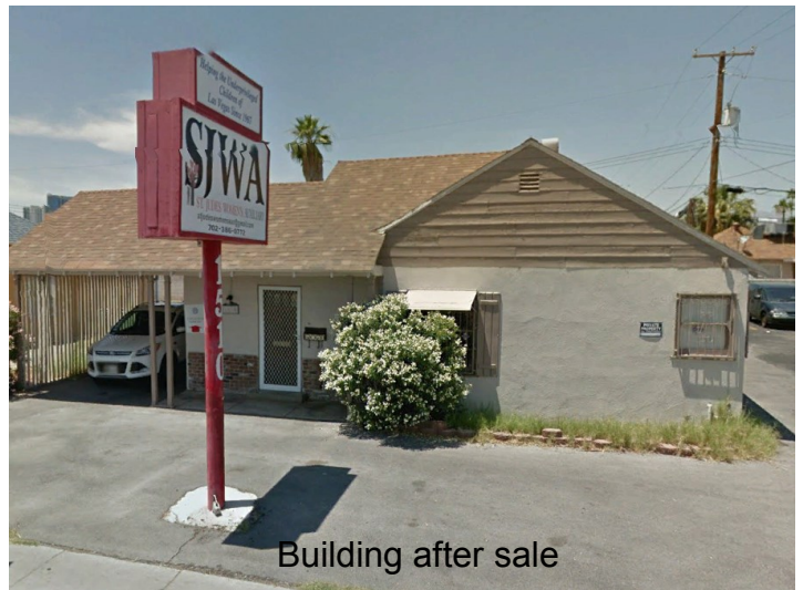
Building after sale

POINT OF CONTACT: Mr. Jack Mishel (702) 324-8147